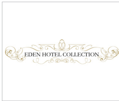
EDEN HOTEL COLLECTION – 25% OFF