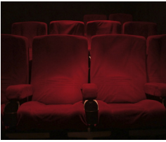
DISCOUNTED CINEMA TICKETS