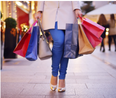
DISCOUNTED RETAIL & LEISURE