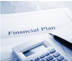
FINANCE & INSURANCE SERVICES