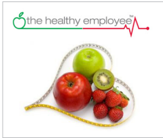
HEALTHY EMPLOYEE SCHEME