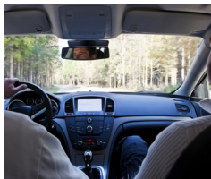
CAR SHARING SCHEME