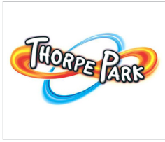
DISCOUNTED TRAVEL & ATTRACTIONS