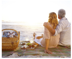
PERSONAL PENSION SCHEME